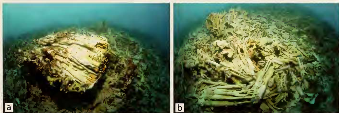
Figure 14. (a) Overturned blue coral Heliopora coerulea and (b) shattered blue coral Heliopora coerulea at 3 m water depth, Teluk Balohan, Pulau Weh, October 28, 2005.